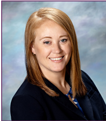
Dr. Daisy Miller Women's Clinic